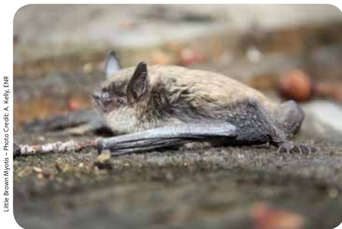
Little Brown Myotis – Photo Credit: A. Kelly, ENR

The Species at Risk (NWT) Act (the Act) provides a process to identify, protect and recover species at risk in the Northwest Territories (NWT). The Act applies to any wild animal, plant or other species managed by the Government of the Northwest Territories. It applies in most areas of the NWT, on both public and private lands, including private lands owned under a land claims agreement.