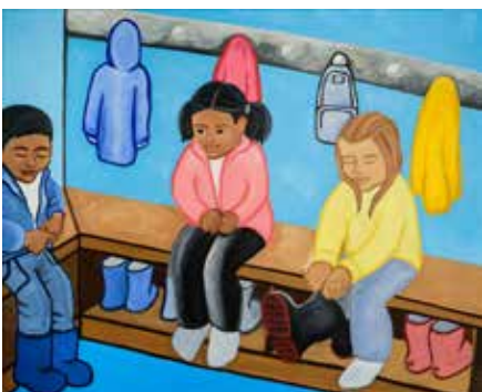
Getting Ready Getting ready to go outside to play, putting on boots and zipping up coats, becoming more independent, learning to take care of yourself.