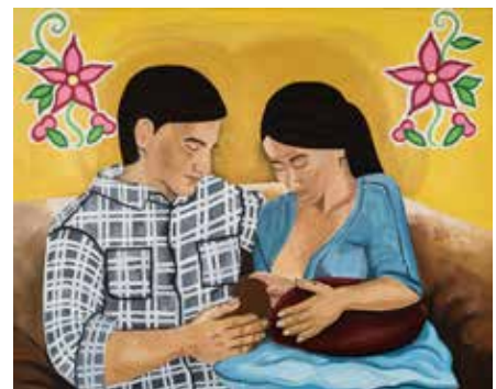
Home with Baby (Dehcho) A new family experiences the growing love and joy in a safe and nurturing home.