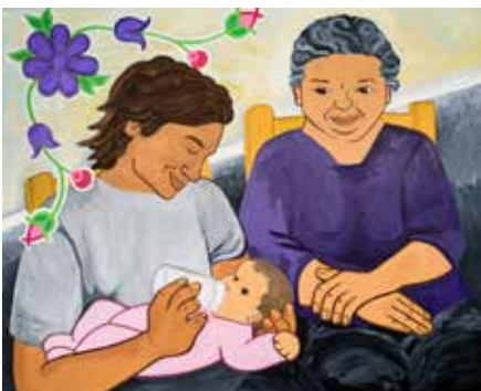
Feeding Baby (South Slave) An Elder patiently showing a young father how to feed and bond with his baby.