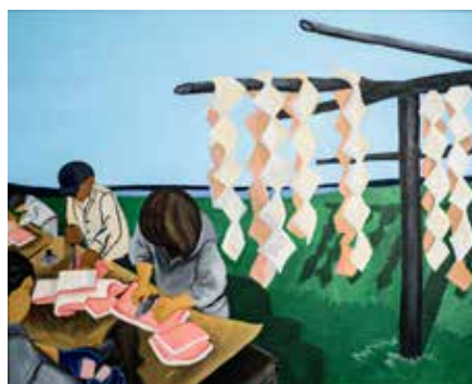
Whale Camp (Inuvialuit) A clear day with no wind nor bugs, it is a nice day to work, share and pass down knowledge.