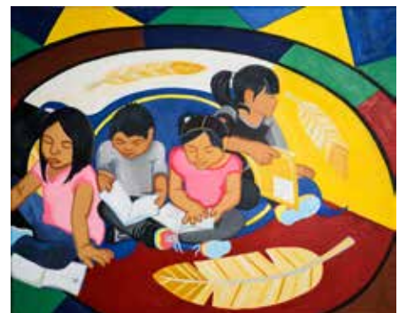
Reading Time Children discovering their love for books, for stories, being comfortable in a classroom with their classmates.