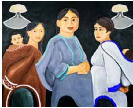
Three Mothers (Inuit) Indigenous women support each other in pregnancy, childbirth and early motherhood.