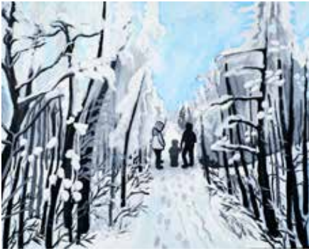
Winter Walk (Yellowknives Dene) A toddler creating memories and a love for the outdoors.