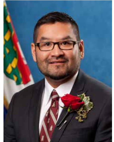
Alfred Moses Minister of Education, Culture and Employment