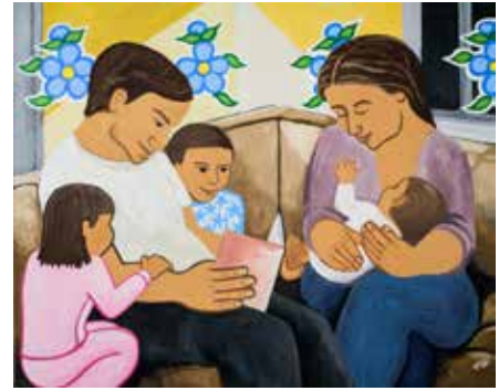
Family Time, Story Time (Tłı̨chʔ) A family with young children spends time together during their bedtime routine.