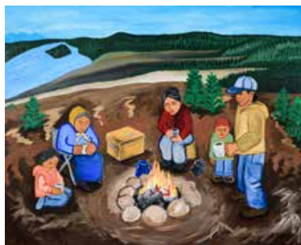
Bush Tea (Gwich'in) Stopping for tea while traveling on the land or to a family camp.