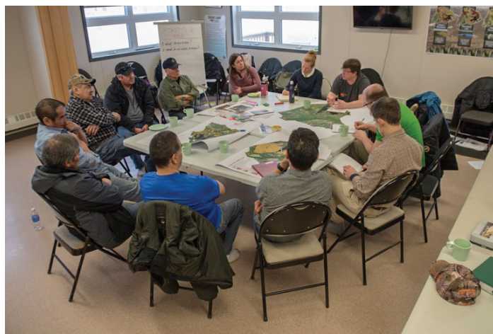
Ne K'ə Dene Ts'ı́łı Forum, Sahtú Landscape Change Workshop, Tulita, NT