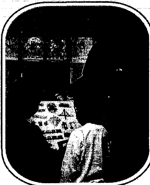
Minister of Education, Culture and Employment Jackson Lafferty, with students at Kaw Tay Whee School

To learn more about literacy programs across the NWT, visit www.ece.gov.nt.ca .