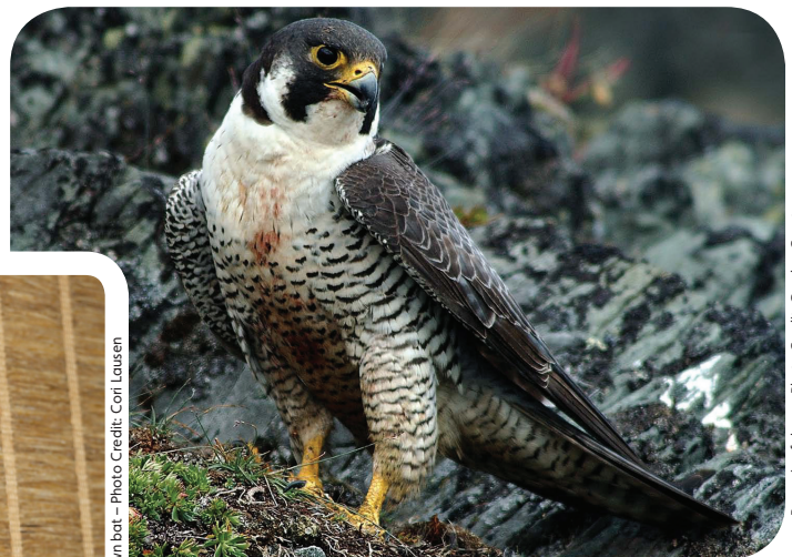
Peregrine falcon