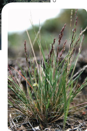
Banks Island alkali grass