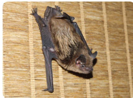
Big brown bat

All Species at Risk Committee documents, including species status reports and assessments, are available on the NWT Species at Risk website: www.nwt-speciesatrisk.ca