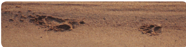
Grizzly bear tracks