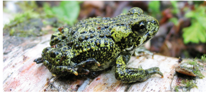
Western toad