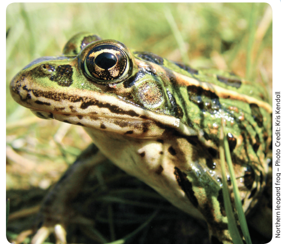
Northern leopard frog