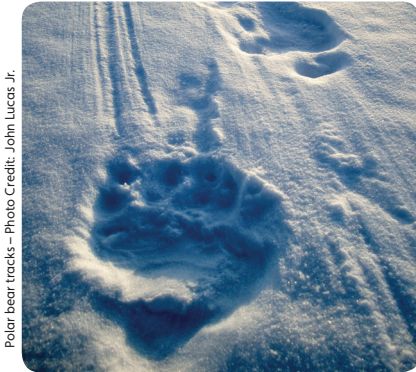
Polar bear tracks

Under subsection 16(1) of the Species at Risk (NWT) Act , the Conference of Management Authorities (Conference) must submit an annual report to the Minister of Environment and Natural Resources by September 30 each year. This annual report covers the fiscal year ending March 31, 2015.