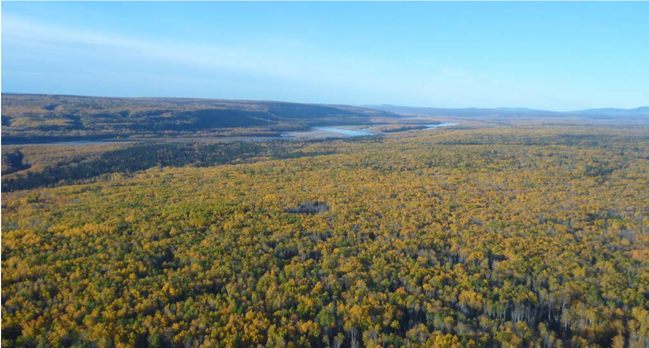
Fort Liard area, Northwest Territories. (OROGO)