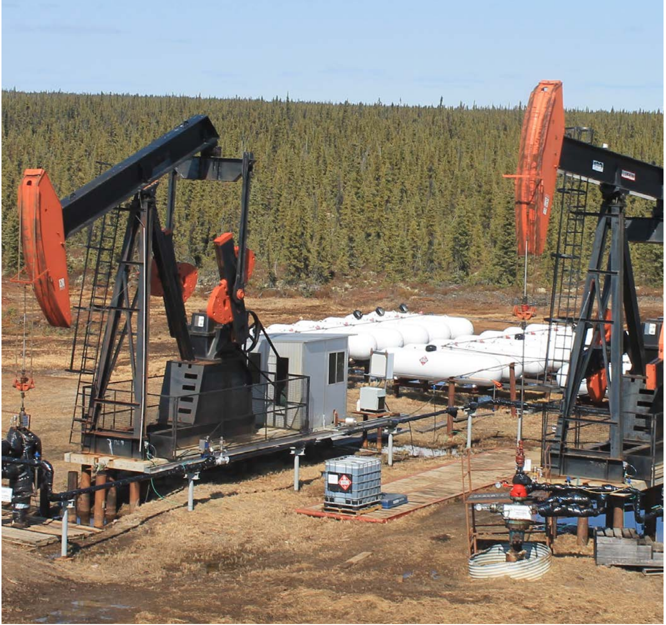
Cameron Hills, Northwest Territories.