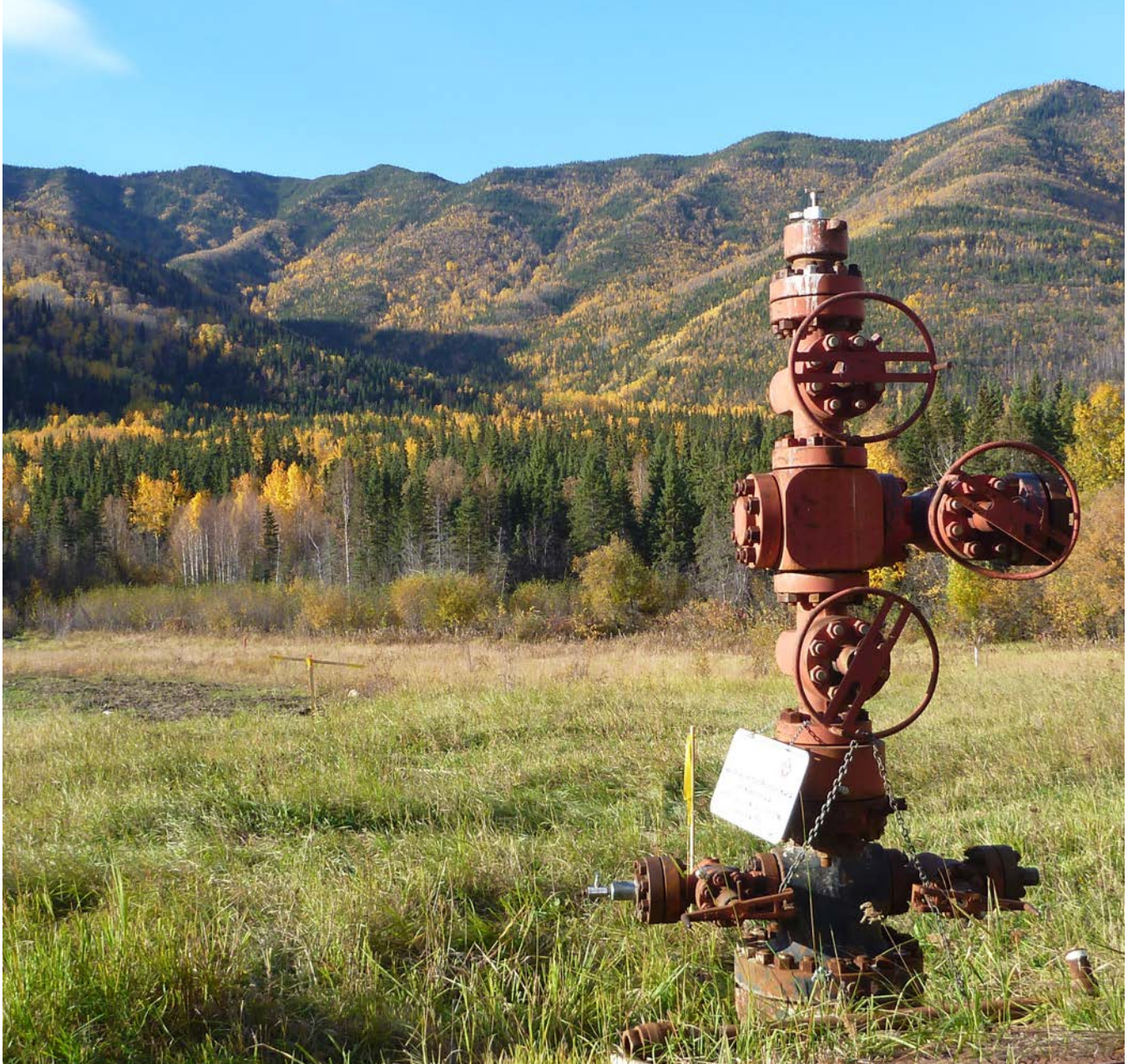
Wellhead in the Fort Liard area, Northwest Territories.

stakeholders, particularly those outside of the oil and gas industry, such as Aboriginal governments and members of communities near proposed Significant Discovery Areas. As the majority of oil and gas activity in OROGO's area of jurisdiction is in the Sahtu region, OROGO also met with stakeholders in that region to share the questions-and-answers document and discuss the SDD process in person.