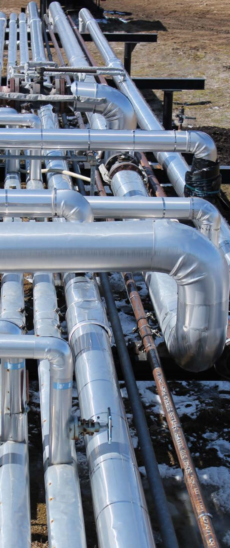
Cameron Hills, Northwest Territories.