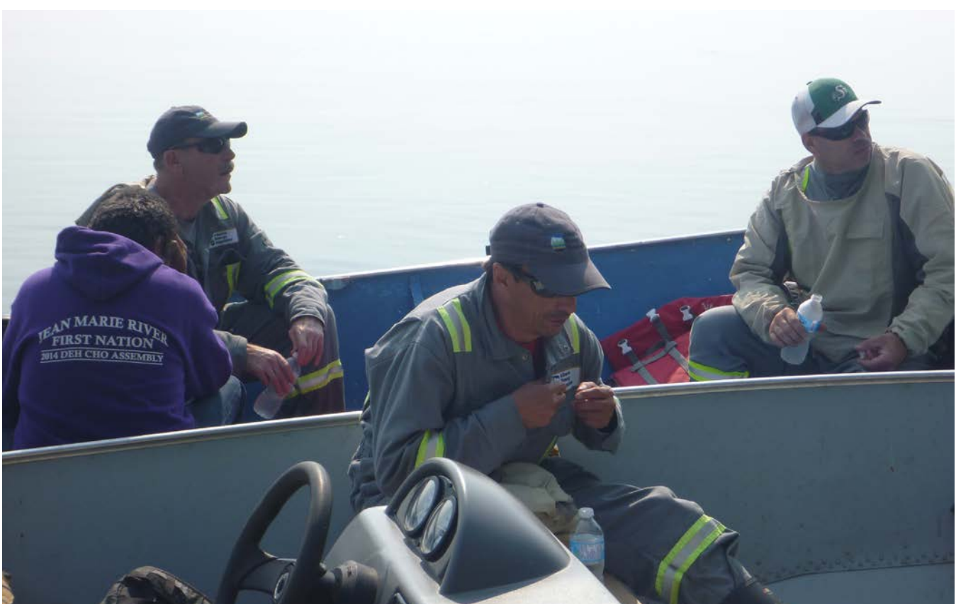
Jean Marie River Inspection Team.

In addition to the formal inspection activities discussed above, OROGO also conducted two site visits in 2014-2015 to familiarize itself with oil and gas infrastructure located in its area of jurisdiction. In May 2014, OROGO visited the Strategic Oil and Gas Ltd. operations in Cameron Hills and in September 2014, OROGO visited well sites and facilities belonging to several operators in the Fort Liard area.