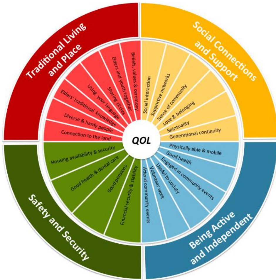
Figure 1: Good Life Affecting Older Adults