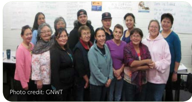
CALR students, staff and instructor of the Aboriginal Language Institute December 2013.

Since the first intake of students in 2010, 14 students have graduated with the CALR. Another 11 students have completed their program and will soon receive their official certificate from UVIC. Out of the 14 students who have graduated, six have gone on to a Master's Degree in Indigenous Language Revitalization and have completed their course work. They are now completing their research to receive their degrees.