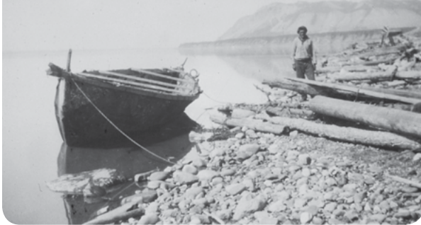
A mooseskin boat is tied to the shore of the Mackenzie River near Tulita (Fort Norman). Circa 1920.