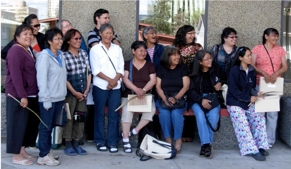
Participants attending the 2010 Summer Language Institute training offered in Yellowknife in collaboration with the University of Victoria.

In November 2009, the department's Official Languages Division met with the University of Victoria, Department of Linguistics to explore a possible partnership to develop and deliver a pilot language institute during the summer of 2010. The meeting resulted in a draft outline of two one-week courses selected from the university's Certificate in Aboriginal Language Revitalization Program that will focus on providing a foundation in the principles and practices of language revitalization.