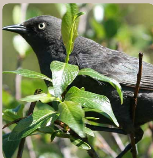
Rusty Blackbird

Committee members must have significant expertise of species, habitat, northern ecosystems or conservation. Members act independently and not as representatives of their appointing bodies.