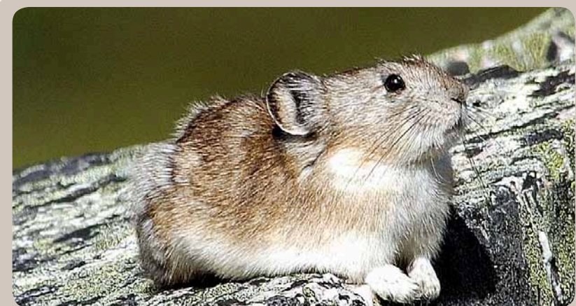
Collared Pika

Environment and Natural Resources, Government of the Northwest Territories, provides full administrative and financial support to the Species at Risk Committee. Contracts for preparing species status reports are advertised on www.contractsregistry.nt.ca .