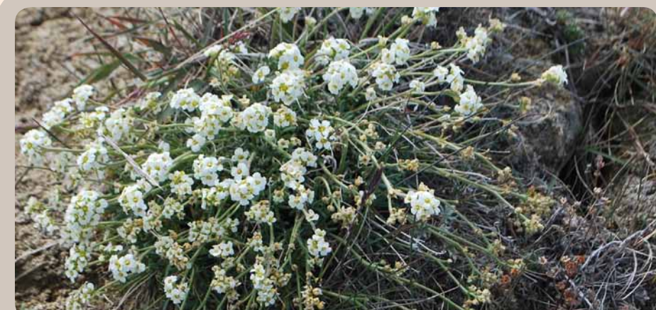
Hairy Braya

The Committee makes its recommendations to the Conference of Management Authorities, a group of boards and governments that share responsibility for the conservation and recovery of species at risk in the NWT. The Conference of Management Authorities includes wildlife co-management boards established under land claim and self-government agreements, the Government of the Northwest Territories, the Tłı̨ch̨o Government and the Government of Canada.