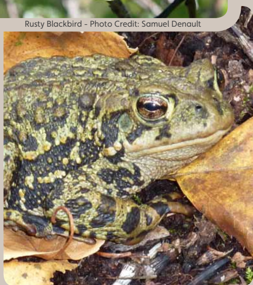
Western Toad - Photo Credit: Floyd Bertand