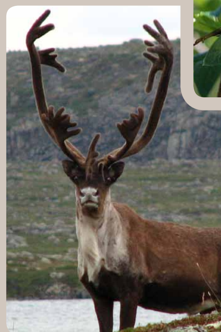
Barren-ground Caribou