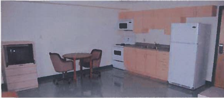
A bachelor unit in Bailey House