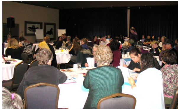
Symposium participants in plenary session

Best practices research also describes individual, family, community, and society-wide interventions.