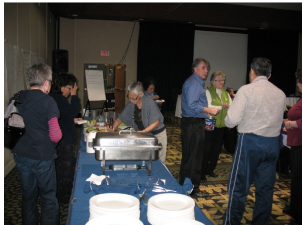
Symposium participants on a health break