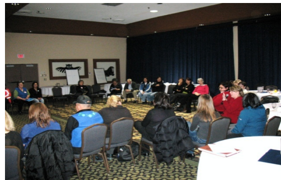
Symposium closing sharing circle