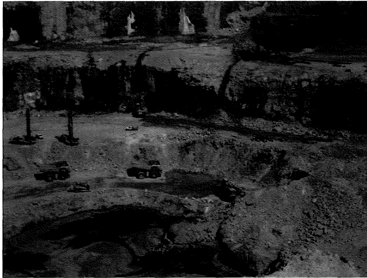
Trucks at work in the Diavik Diamond Mine open pit.

In the future, when resource revenue-sharing agreements are struck on the disposition of royalties to public and aboriginal governments, it may be more beneficial to territorial interest if capital cost incentives are linked to federal taxation. These are choices that have been made in other provinces to ensure the flow of fiscal resources to construct required infrastructure quickly. Certainly, an argument can be made that incentives for resource development should be constructed from federal fiscal resources in the future, rather than those of the region which has so many costs to bear in providing infrastructure and services to support development.