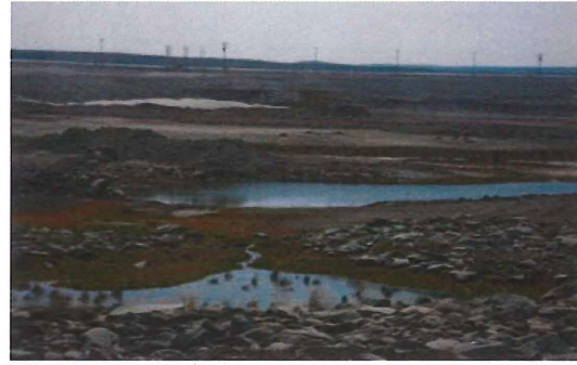
Diavik diamond mine, June 2007

Much has changed since the opening of the Ekati Diamond Mine in October 1998. Although diamond-bearing kimberlite pipes had been discovered, there were no firm confirmations of the magnitude of the riches to be found beneath the permafrost. At the time, the labour market in the Northwest Territories was slow and plenty of skilled trades people were available to start up the industry. The NWT desperately needed development to get its economy out of a protracted slump. The mines were welcomed and not many conditions were put in the way of rapid development.