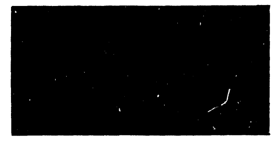
Contracts and Capital Planning Division