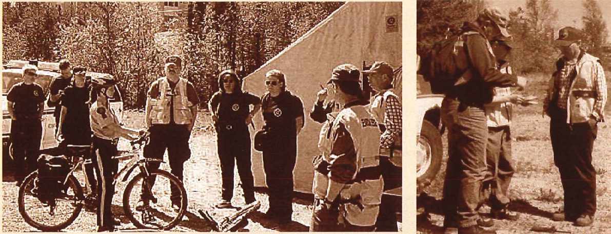
Working together in partnerships and collaboration prevents and reduces the severity of SAR incidents.

PARTICIPANT - INUVIK BEAUFORT REGIONAL CONSULTATION