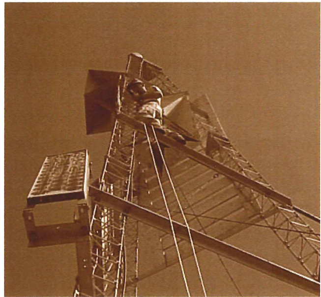
Installing communications infrastructure has reduced the incidents of marine SAR

* “WE MUST BEGIN TO USE TECHNOLOGIES THAT HAVE BEEN IN THE NORTH FOR THE PAST DECADE. THEY HAVE PROVEN THEMSELVES TO BE A VALUABLE TOOL FOR PREVENTING SEARCH AND RESCUE INCIDENTS ON THE LAND AND ON THE WATER.” PARTICIPANT - SOUTH SLAVE REGIONAL CONSULTATION