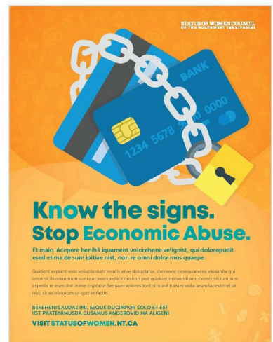
Service Providers & Affected Individuals