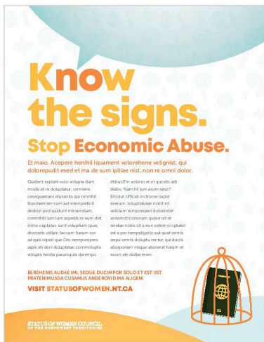
Policy-Makers & Legislators

Thank you to Women and Gender Equality Canada for providing the funding to realize this project.