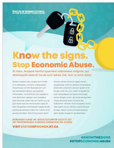
Financial Institutions & Organizations