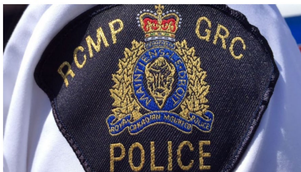
RCMP are working to improve sexual assault investigations by drawing on the expertise of victim advocates.

Avery Zingel · CBC News · Posted: Apr 06, 2021 7:00 AM CT | Last Updated: April 6