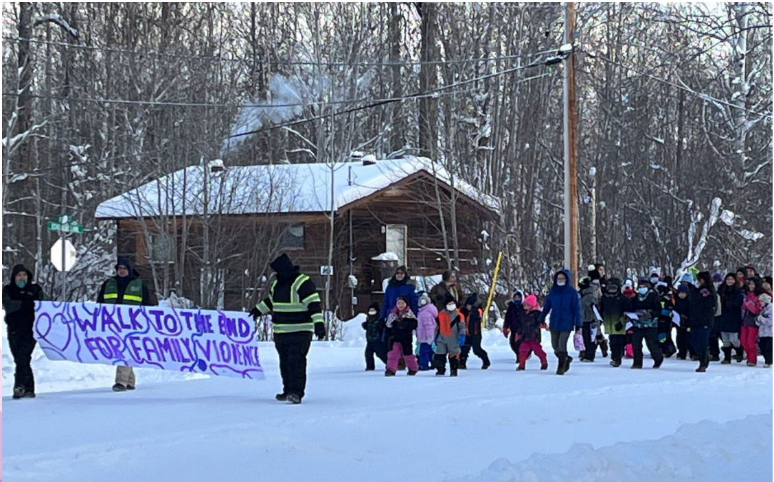
Photo from the Fort Liard Community Awareness Walk

Scavenger hunts, community walks, family movie nights, art contests, sewing circles, workshops, training, game nights, radio shows, and more took place across the NWT as communities held covid-friendly family violence prevention/health family activities.