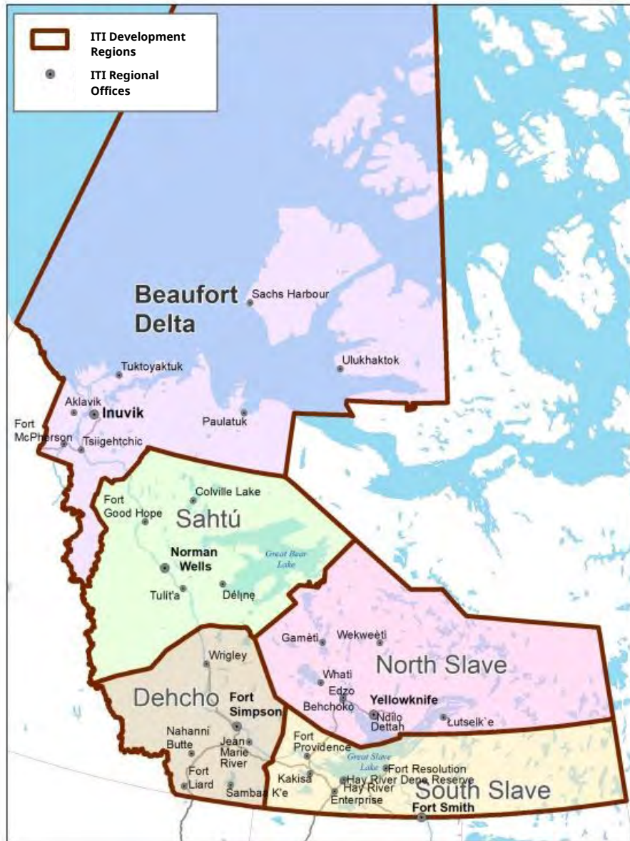
Figure 1: Map of the NWT Administrative Regions