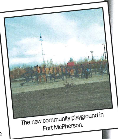
The new community playground in Fort McPherson.

The Hamlet of Sachs Harbour received phase one funding of $35,775 to complete repairs on the community arena. The community contributed cash and in-kind labour services as part of the project. The project is expected to be complete in 2005-2006.