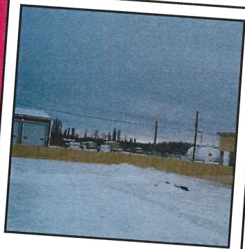
The outdoor rink in Jean Marie River.

The Hamlet of Fort Liard received funding of $49,408 for the construction of a new park/playground. The community reports that local children enjoy using the new equipment.