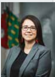
HONOURABLE LESA SEMMLER Minister of Health and Social Services