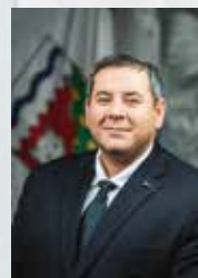
HONOURABLE VINCE MCKAY Minister of Municipal and Community Affairs Minister Responsible for Workers' Safety and Compensation Commission Minister Responsible for the Public Utilities Board