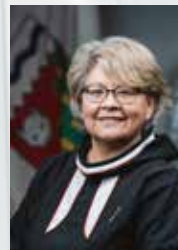
HONOURABLE LUCY KUPTANA Minister Responsible for Housing Northwest Territories Minister Responsible for the Status of Women