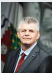
HONOURABLE JAY MACDONALD Minister of Environment and Climate Change