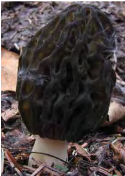
Black Morel M. elata