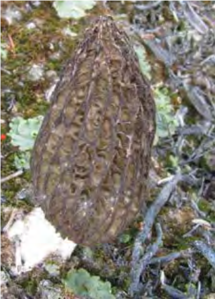
Typical Fire Morel Morchella conica