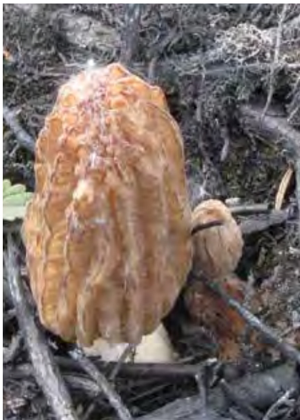
Yellow Morel M. esculenta